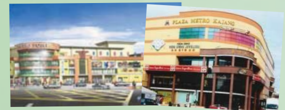
3 minutes drive to the town center.